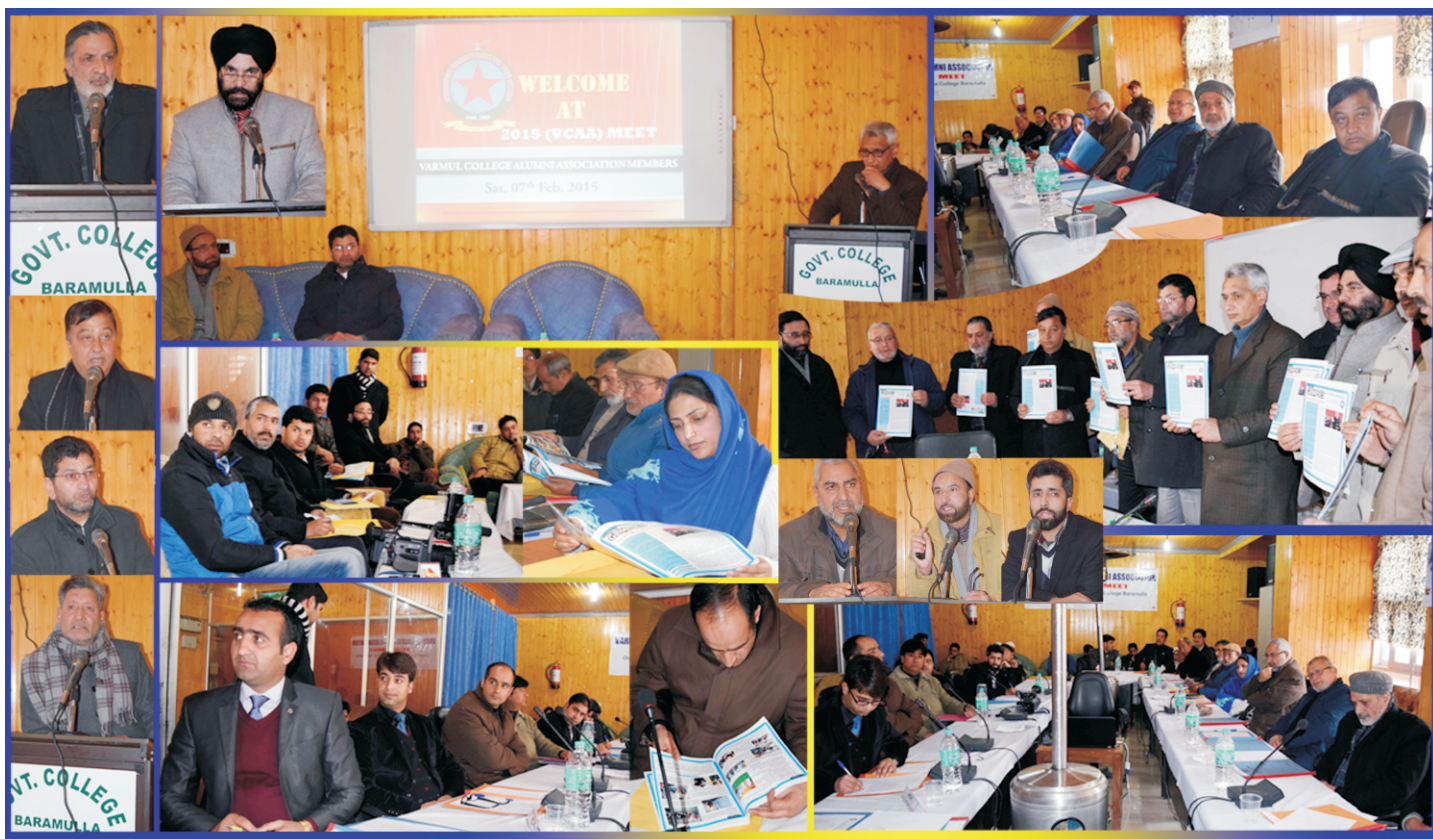
VARMUL COLLEGE ALUMNII ASSOCIATION MEET (VCAA) FEB. 2015